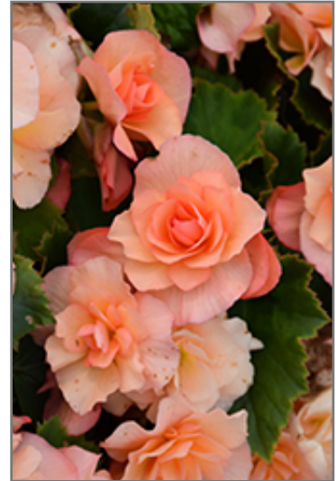
Solenia Apricot Begonia flowers

Solenia Apricot Begonia is recommended for the following landscape applications;