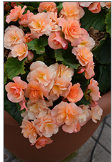
Solenia Apricot Begonia flowers