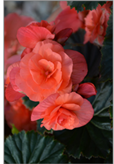
Solenia Salmon Coral Begonia flowers

This is a high maintenance plant that will require regular care and upkeep, and usually looks its best without pruning, although it will tolerate pruning. Deer don't particularly care for this plant and will usually leave it alone in favor of tastier treats. Gardeners should be aware of the following characteristic(s) that may warrant special consideration;