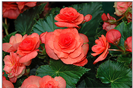
Solenia Salmon Coral Begonia flowers