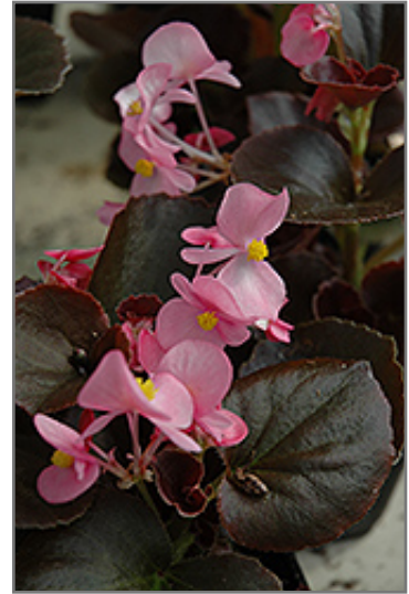
Cocktail Gin Begonia flowers