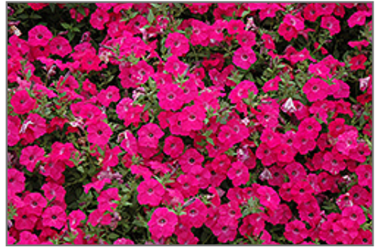
Tidal Wave Hot Pink Petunia in bloom