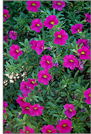
Aloha Neon Calibrachoa flowers

A stunning early flowering, semi-trailing series presenting small green foliage and masses of large, brightly colored blooms; a wonderful addition to sunny containers, hanging baskets, beds and borders; easy to grow and requires little to no maintenance