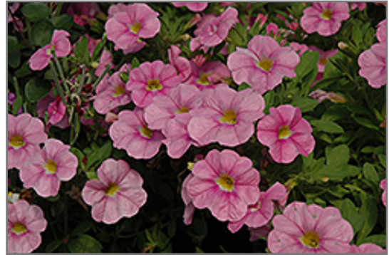
Aloha Soft Pink Calibrachoa flowers

Aloha Soft Pink Calibrachoa is recommended for the following landscape applications;