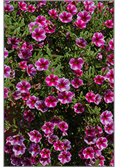
Can-Can Hot Pink Star Calibrachoa flowers

Can-Can Hot Pink Star Calibrachoa is recommended for the following landscape applications;