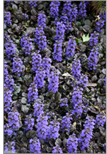
Black Scallop Bugleweed flowers

Black Scallop Bugleweed is recommended for the following landscape applications;