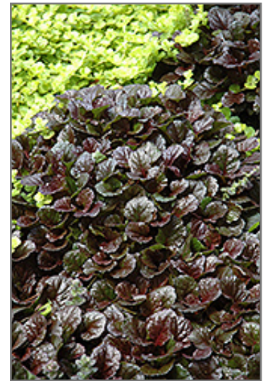
Black Scallop Bugleweed