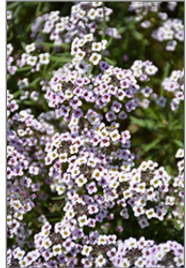
Blushing Princess Sweet Alyssum flowers

This plant will require occasional maintenance and upkeep, and should not require much pruning, except when necessary, such as to remove dieback. It is a good choice for attracting bees and butterflies to your yard, but is not particularly attractive to deer who tend to leave it alone in favor of tastier treats. It has no significant negative characteristics.