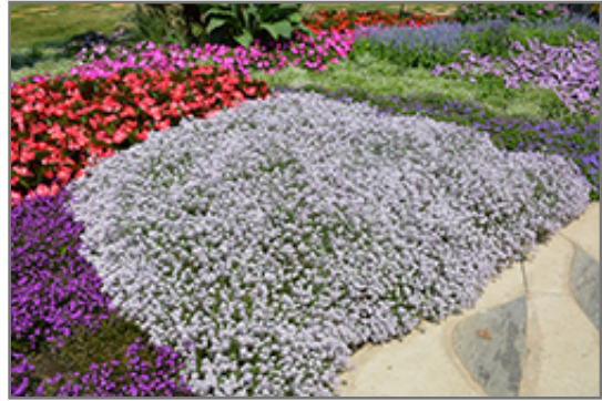
Blushing Princess Sweet Alyssum in bloom

* This is a 'special order' plant - contact store for details