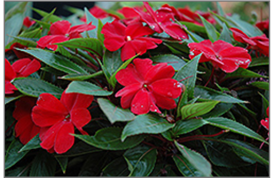
Celebrette Red New Guinea Impatiens flowers