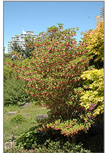
Redvein Enkianthus in bloom