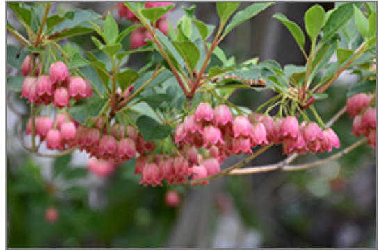
Redvein Enkianthus flowers