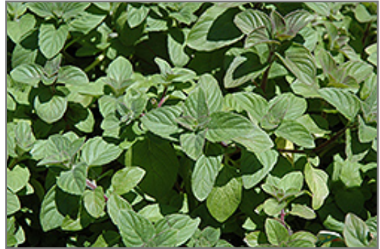
Swiss Mint foliage