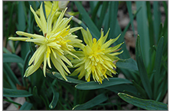
Rip Van Winkle Daffodil flowers