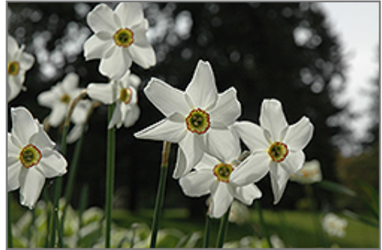
Pheasant's Eye Daffodil flowers