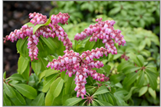
Shojo Japanese Pieris flowers

Shojo Japanese Pieris is recommended for the following landscape applications;