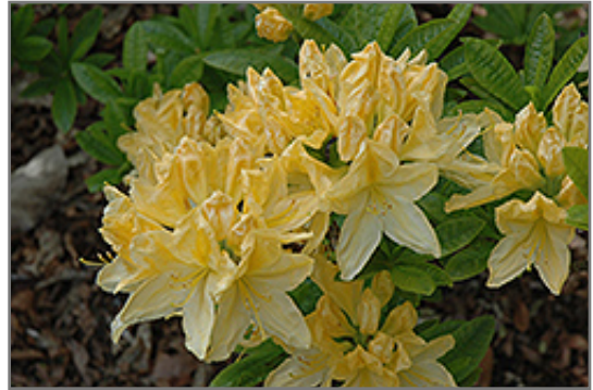
Yellow Azalea flowers

Yellow Azalea will grow to be about 8 feet tall at maturity, with a spread of 8 feet. It tends to be a little leggy, with a typical clearance of 1 foot from the ground, and is suitable for planting under power lines. It grows at a slow rate, and under ideal conditions can be expected to live for 40 years or more.