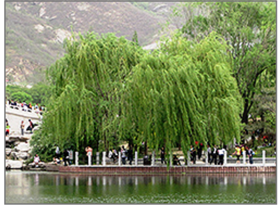
Weeping Hankow Willow