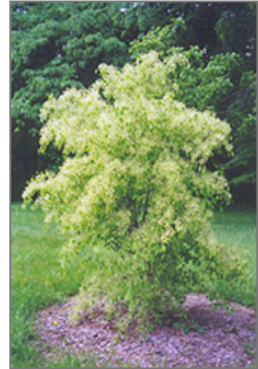
Maack's Spindle Tree in bloom