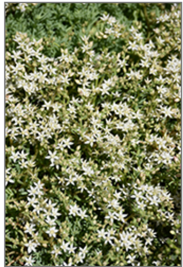
Dwarf Spanish Stonecrop flowers