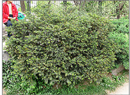
Umbrelliform Yew

A wide-growing evergreen shrub with dense branching covered in narrow foliage that appears in whorls on the branchlets, exposing the gray undersides; spectacular in groupings, a great accent for large spaces, takes pruning extremely well, loves shade