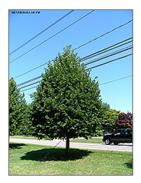
Silver Dollars Linden

This is a relatively low maintenance tree, and is best pruned in late winter once the threat of extreme cold has passed. It is a good choice for attracting bees to your yard. Gardeners should be aware of the following characteristic(s) that may warrant special consideration;