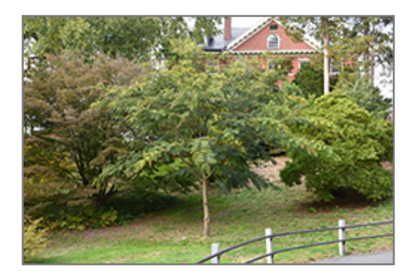
E.H. Wilson Mimosa

361 N. Hunter Highway Drums, PA 18222 (570) 788-4181 www.beechwood-gardens.com