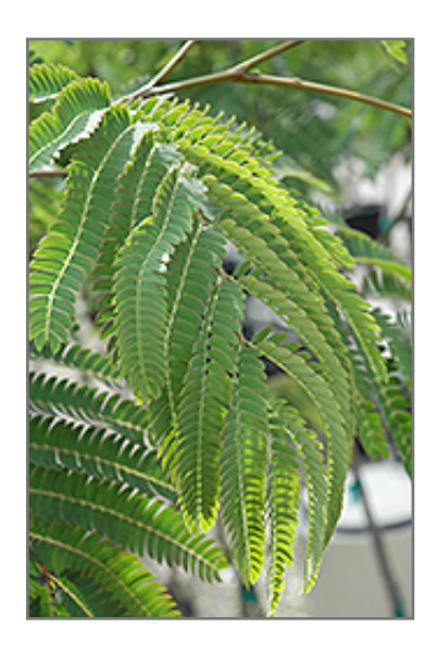
E.H. Wilson Mimosa foliage

* This is a 'special order' plant - contact store for details