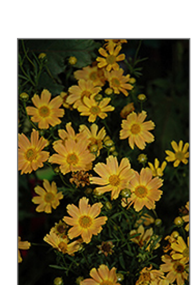
Sweet Marmalade Tickseed flowers