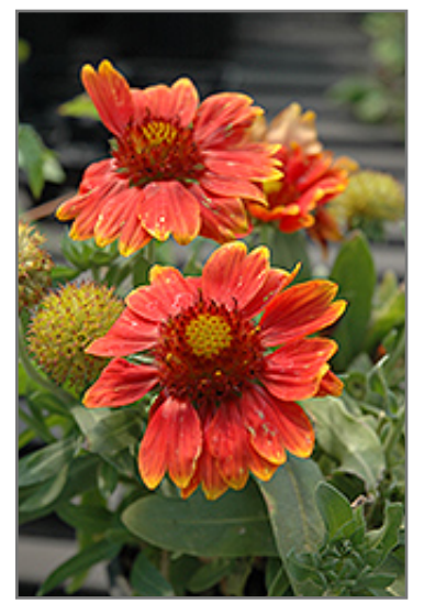
Gallo Orange Blanket Flower flowers