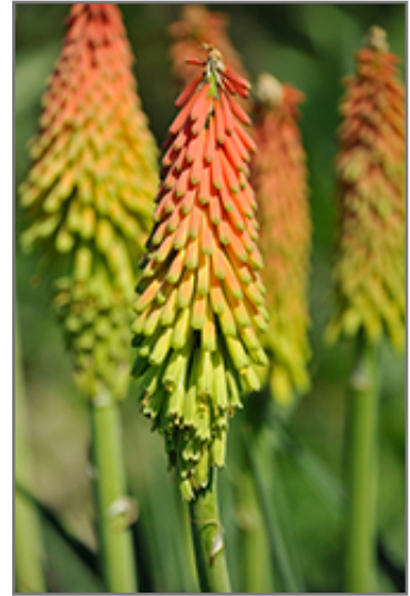
Fire Dance Torchlily flowers

Amazing red, orange, and bright yellow flower stalks rise from grassy, evergreen foliage in midsummer, creating a brilliant border or container planting; makes a great cutflower and attracts hummingbirds