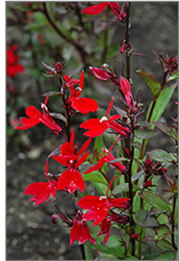
Fan Scarlet Cardinal Flower flowers