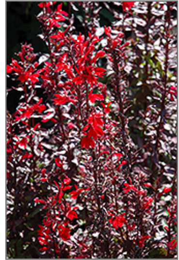
Fan Scarlet Cardinal Flower flowers