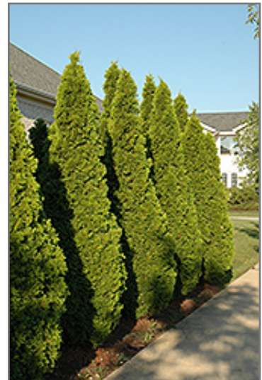
Emerald Green Arborvitae