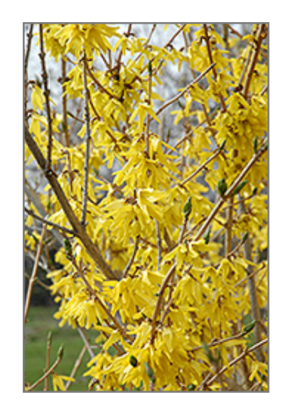
Northern Gold Forsythia flowers