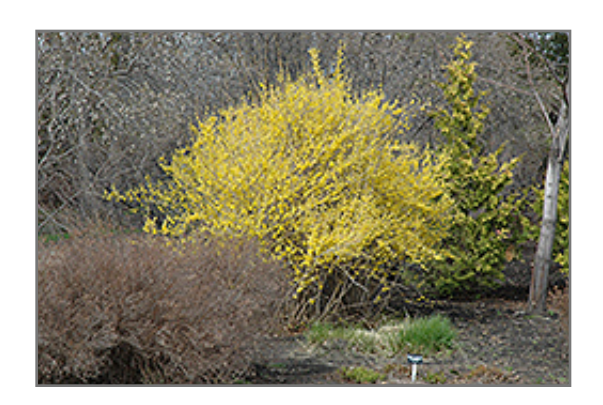
Northern Gold Forsythia in bloom

361 N. Hunter Highway Drums, PA 18222 (570) 788-4181 www.beechwood-gardens.com