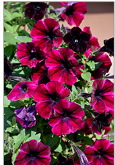
Sweetunia Johnny Flame Petunia flowers