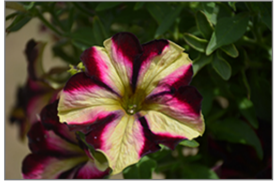
Crazytunia Pulse Petunia flowers

Crazytunia Pulse Petunia is recommended for the following landscape applications;