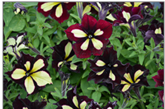
Crazytunia Star Jubilee Petunia flowers