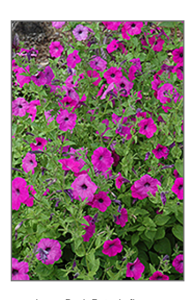
Laura Bush Petunia flowers

Laura Bush Petunia will grow to be about 18 inches tall at maturity, with a spread of 30 inches. When grown in masses or used as a bedding plant, individual plants should be spaced approximately 24 inches apart. Its foliage tends to remain dense right to the ground, not requiring facer plants in front. This fast-growing annual will normally live for one full growing season, needing replacement the following year.