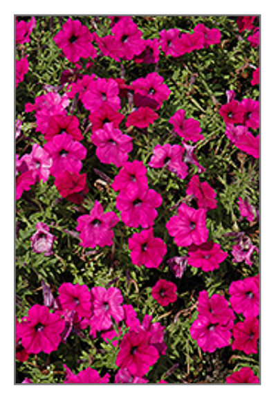
Trilogy Purple Petunia flowers

361 N. Hunter Highway Drums, PA 18222 (570) 788-4181 www.beechwood-gardens.com