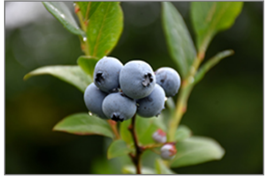
Northsky Blueberry fruit

Northsky Blueberry features dainty clusters of white bell-shaped flowers with shell pink overtones hanging below the branches in mid spring. It has green deciduous foliage. The glossy oval leaves turn an outstanding scarlet in the fall. It features an abundance of magnificent blue berries in mid summer.