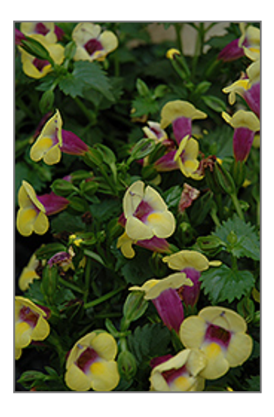
Yellow Moon Torenia flowers

Yellow Moon Torenia is an herbaceous annual with a trailing habit of growth, eventually spilling over the edges of hanging baskets and containers. Its relatively fine texture sets it apart from other garden plants with less refined foliage.