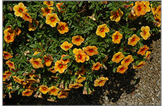
Aloha Tiki Mango Calibrachoa flowers

Aloha Tiki Mango Calibrachoa is recommended for the following landscape applications;