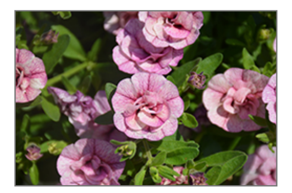
MiniFamous Double Pink Vein Calibrachoa flowers

361 N. Hunter Highway Drums, PA 18222 (570) 788-4181 www.beechwood-gardens.com