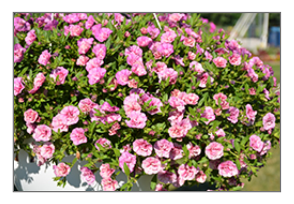
MiniFamous Double Pink Vein Calibrachoa in bloom