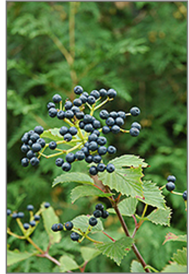
Blue Muffin Viburnum fruit

Blue Muffin Viburnum is recommended for the following landscape applications;