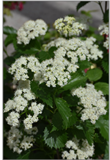
Blue Muffin Viburnum flowers