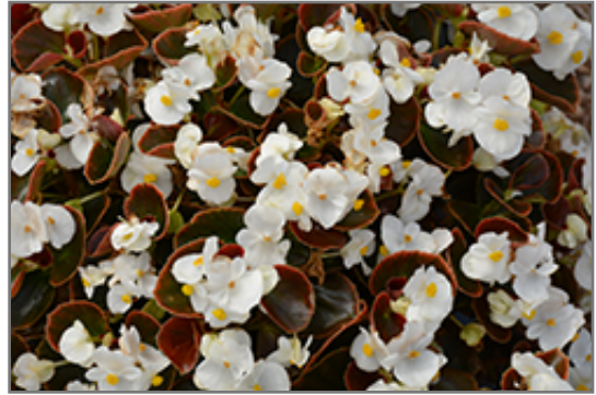
Nightife White Begonia flowers