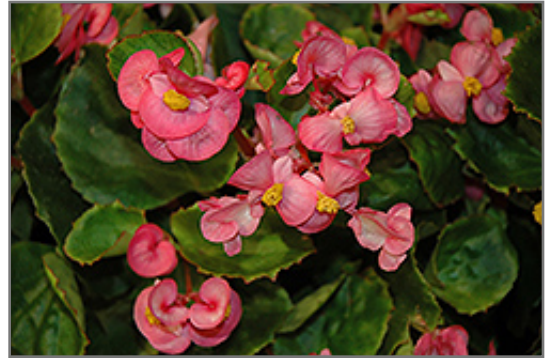
Sprint Deep Pink Begonia flowers