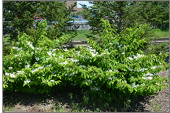
Lanarth Doublefile Viburnum in bloom