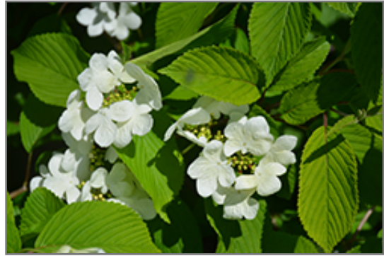
Lanarth Doublefile Viburnum flowers