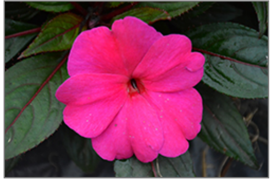
Magnum Blue New Guinea Impatiens flowers

Magnum Blue New Guinea Impatiens is recommended for the following landscape applications;