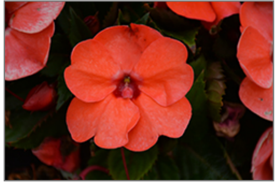
SunPatiens Compact Hot Coral New Guinea Impatiens flowers

This plant will require occasional maintenance and upkeep, and should not require much pruning, except when necessary, such as to remove dieback. It is a good choice for attracting bees and butterflies to your yard. It has no significant negative characteristics.