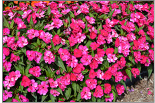
SunPatiens Compact Royal Magenta New Guinea Impatiens in bloom

SunPatiens Compact Royal Magenta New Guinea Impatiens will grow to be about 24 inches tall at maturity, with a spread of 24 inches. When grown in masses or used as a bedding plant, individual plants should be spaced approximately 20 inches apart. Its foliage tends to remain dense right to the ground, not requiring facer plants in front. This fast-growing annual will normally live for one full growing season, needing replacement the following year.