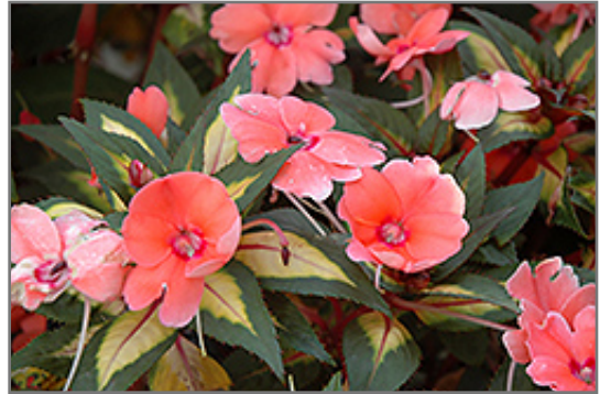
SunPatiens Vigorous Coral New Guinea Impatiens flowers

SunPatiens Vigorous Coral New Guinea Impatiens is recommended for the following landscape applications;