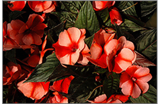
Harmony Salmon Cream New Guinea Impatiens flowers

Harmony Salmon Cream New Guinea Impatiens is recommended for the following landscape applications;