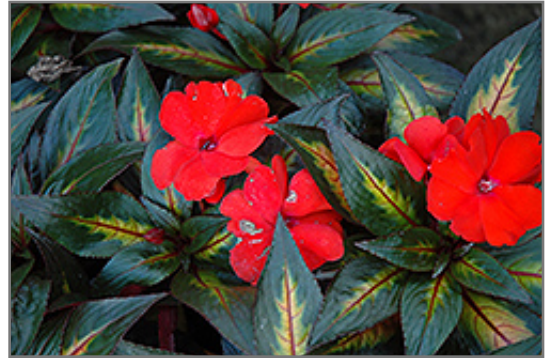
Strike Orange New Guinea Impatiens flowers

Strike Orange New Guinea Impatiens is recommended for the following landscape applications;