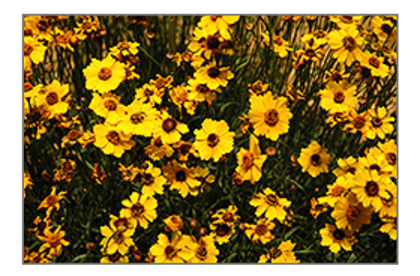
Highland Gold Tickseed flowers

361 N. Hunter Highway Drums, PA 18222 (570) 788-4181 www.beechwood-gardens.com