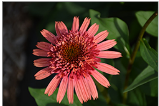
Supreme Flamingo Coneflower flowers