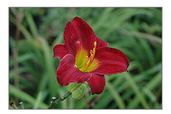
Stella In Red Daylily flowers

361 N. Hunter Highway Drums, PA 18222 (570) 788-4181 www.beechwood-gardens.com